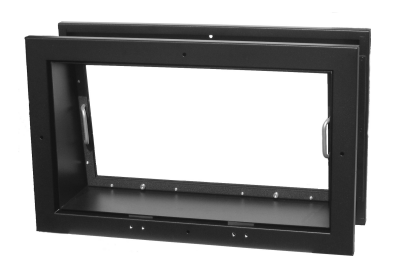
Medium View port (no Projector Shelf)