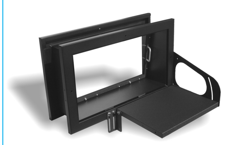
Medium Projection / View port (includes Projector Shelf)