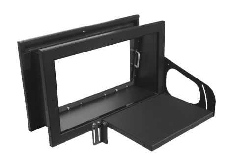
Medium Projection / View port (includes Projector Shelf)